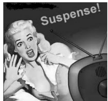
It Came From Eponia

But the suspension of the officials this week may have the effect of radicalising the formerly meek. Within two hours of the news of the suspension spreading, some 2,000 employees had organised themselves into a demonstration. The Munich police closed off Erhardstrasse with almost no notice to facilitate this demonstration, and Merpel's very many eye-witness correspondents tell her that the most remarkable fact of this large attendance was that it contained a lot of new faces, particularly at Director level. These are the guys (and gals) who have had to enforce the relentless increase in production targets on the Examiners below them, and who have largely kept their heads well below the parapet ... until now. Radicalising the meek is usually a mistake because they get so very angry, having kept their secret rage tightly bottled in for so long.